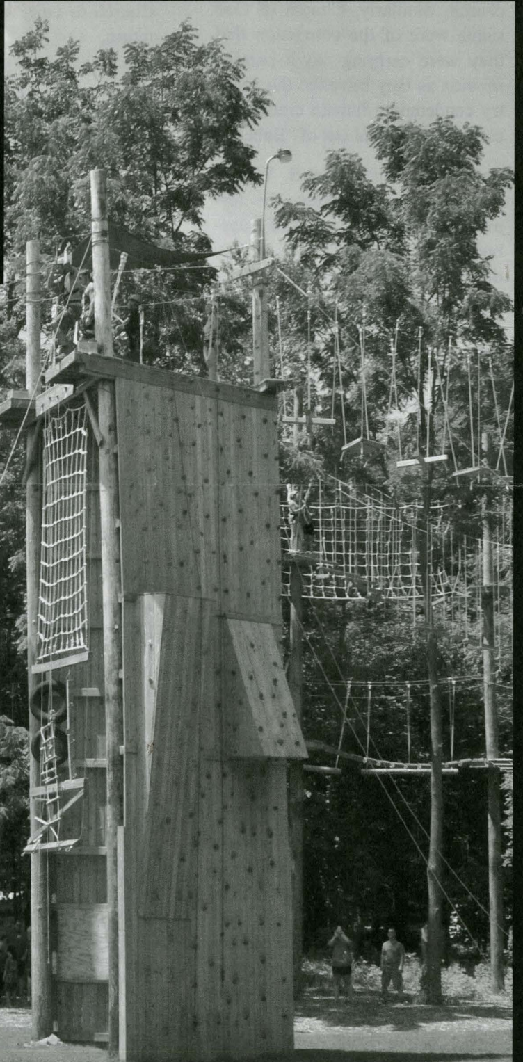
The newly built climbing wall, which will serve the physical and relational needs of young people for years to come.

Pictured here are two structures at Warner Memorial Camp, Grand Junction, Michigan.