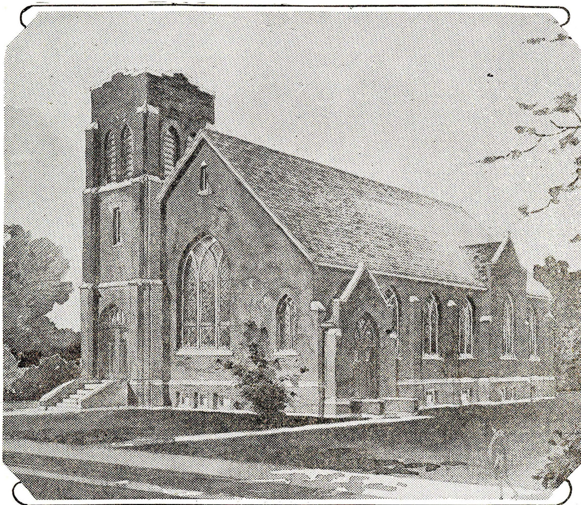
New Church of God, Ellwood City, Pa.