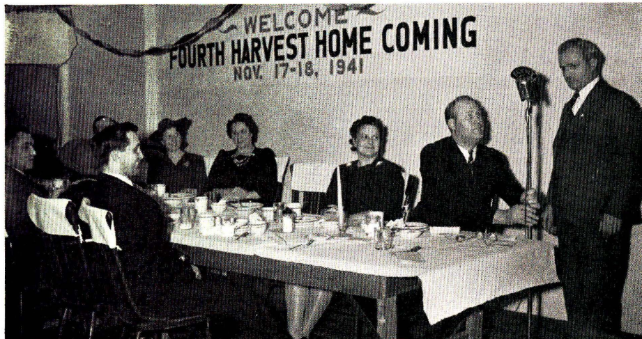
Getting ready for the welcome address

Dr. Peale told of a mathematician, a scientific genius, who said to him recently: "You are a preacher, and I want to tell you this: What this country needs more than anything else is religion. Why don't you and the other preachers give it to us — real old-fashioned religion?"