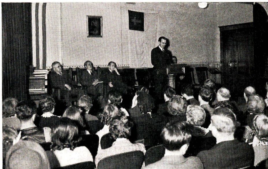
Home-Comers' Chapel Hour

The President, after a few words of acceptance, led the congregation in (Continued on page 6)