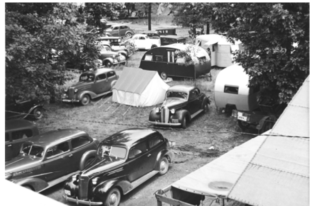
Tenting and Parking at Campmeetings Past