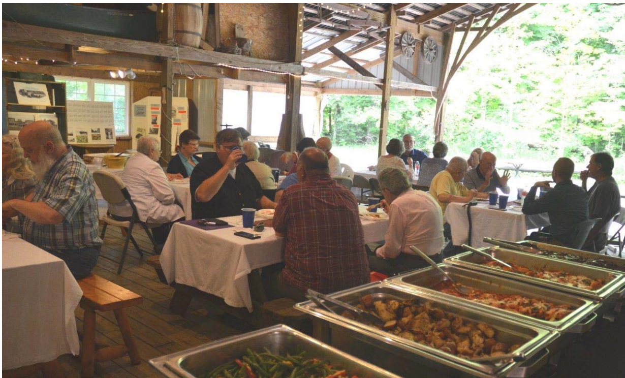
Below: Catered dinner for those who risked staying to brave the oncoming storm